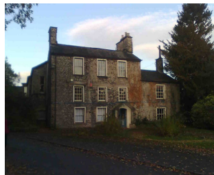
Castle Lodge just off Aynam Road in Kendal

Having identified some suitable premises that would give us much more space in September last year, we were hopeful that we would be able to move in by November. However, things have moved much more slowly than anticipated. Despite very positive meetings with the landlord, the translation of requirements into 'Solicitor speak' in the lease agreement has proved very difficult and the lease has had to be drafted and redrafted several times. We are now in the middle of February and we still do not have a signed lease. However, we are hopeful that all the obstacles have been overcome we should have a signed document by the end of this month.