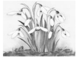
Snowdrops - the first sign of Spring

As we give thanks for the love and care displayed in our homes by our mothers, may we meet the challenge to bring hope and love to those outside our families who need care and concern.