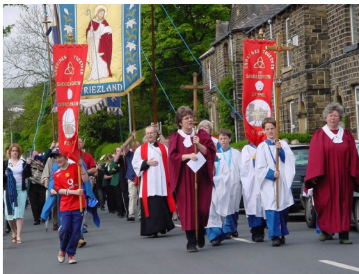
Friezland Christ Church with Lydgate. St Anne's Church accompanied by Lydgate Band - Whit Friday morning 2005.