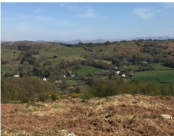
Winster from the West

Through woodland you may see squirrels and in the heathland rabbits and deer. You will almost certainly view some quite large badger sets and in the Spring and Summer months hear almost continuous birdsong.