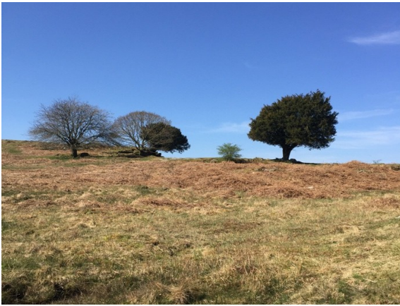
Windyhowe Hill in early Spring

to Rosthwaite farm and up to Rulbutts Hill which is another short deviation from the main path.