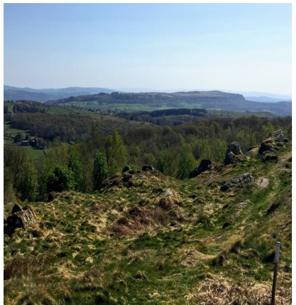
Whitbarrow from Rulbutts Hill

The best viewpoints of the walk are at Rosthwaite Heights and Rulbutts Hill, but between these look out for the sculptures set out around the gardens of Rosthwaite Farm.