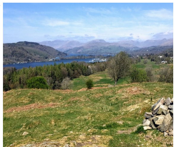
Loughrigg and Fairfield from Rosthwaite Height

Rosthwaite Heights are the perfect place to stop for a rest and sustenance and to survey the lake in all its glory. Having done so retrace your steps and head back to the oak tree. From here head