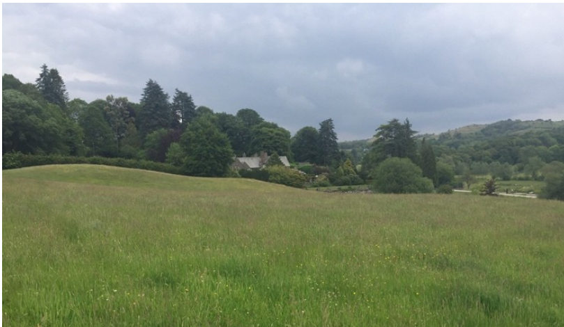
Birkett Houses, Winster