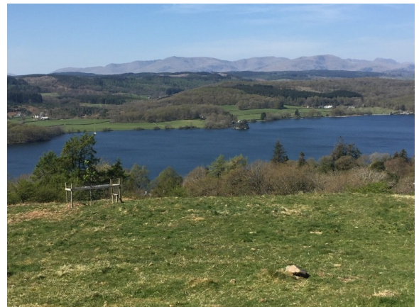
The Furness fells from Rosthwaite Height