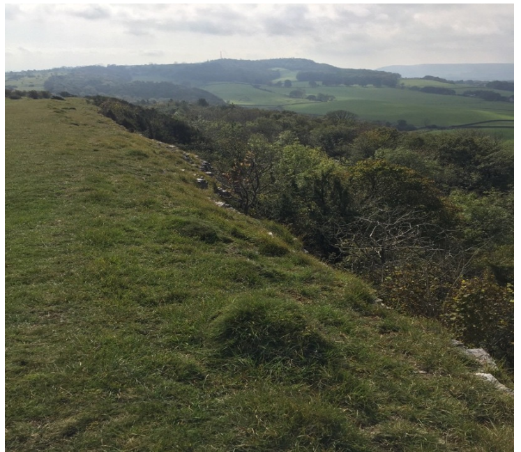
Views From Cunswick Scar