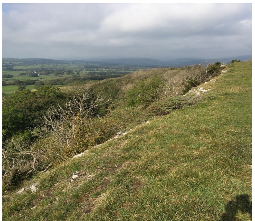
The Woods below Cunswick Scar