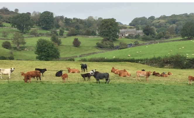
Lush pastures Provide fodder for the healthiest of farm livestock.

Make your way through our lovely village towards Underbarrow until you get to the Blacksmiths beyond the Punchbowl. Take the little road here and then right onto the public footpath. Left at Broom Lane until Blakebank where the path takes you through this pretty garden and down to Underbarrow. Take the path in the village which goes through Nook Farm and then take care to choose the right turnings as you aim for the foot of Gamblesmire Lane.