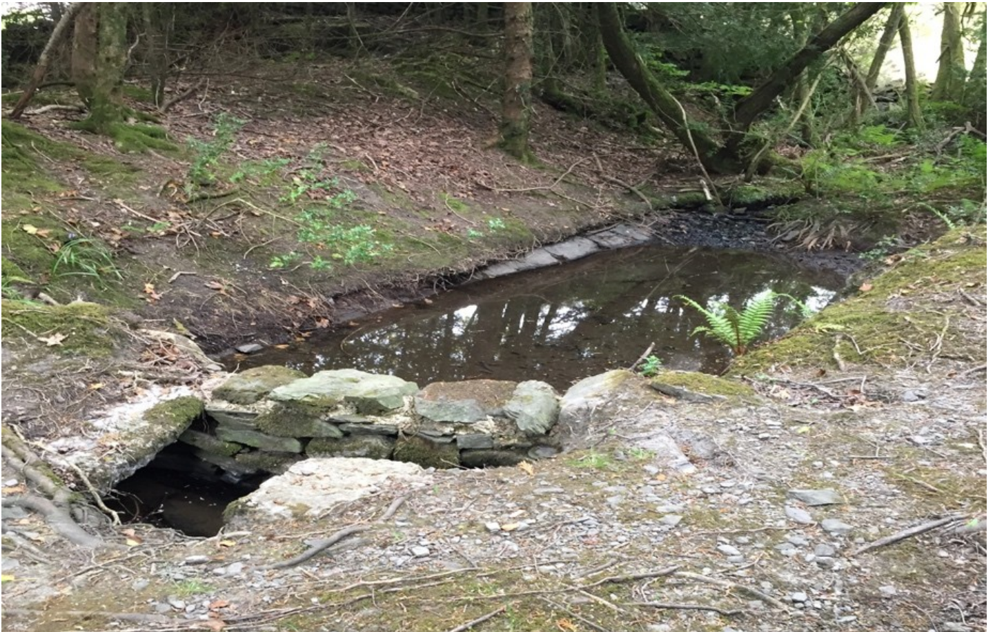
Water dam at Hubbersty |Head