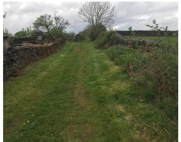
Head Lane at the top of Totter Bank