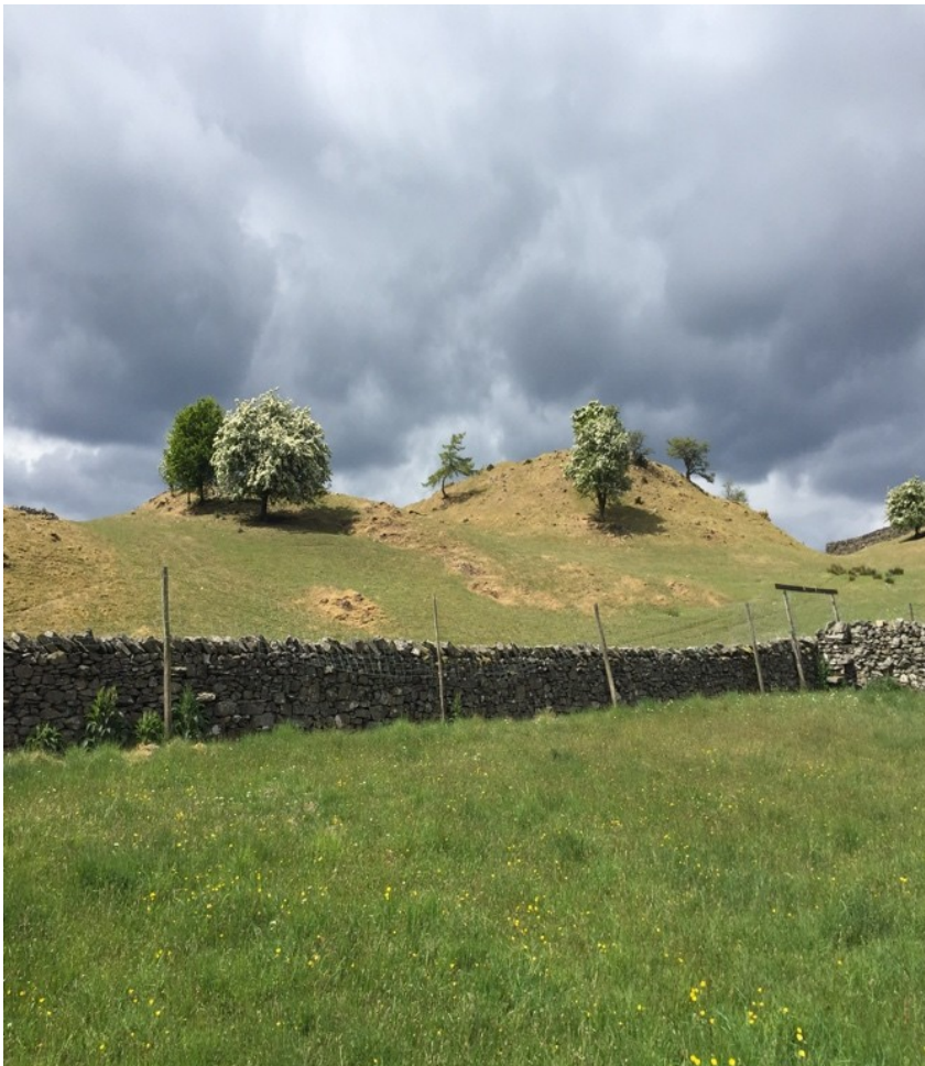
Windyhowe Hill with spring blossom