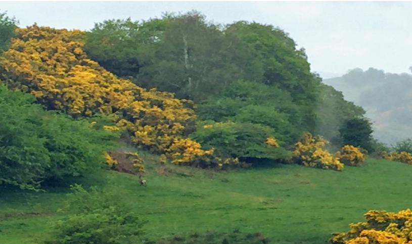
Deer running on the Foxholes ridge

This walk is a perfect introduction to the countryside in this quiet, undulating part of south Lakeland. Ancient tracks, dry stone walls and hillocks with rocky limestone outcrops delight alongside the flora that compliments this landscape. Whilst the walking is gentle, the height achieved on the 'right to roam' land above Foxhole Bank gives magnificent views.