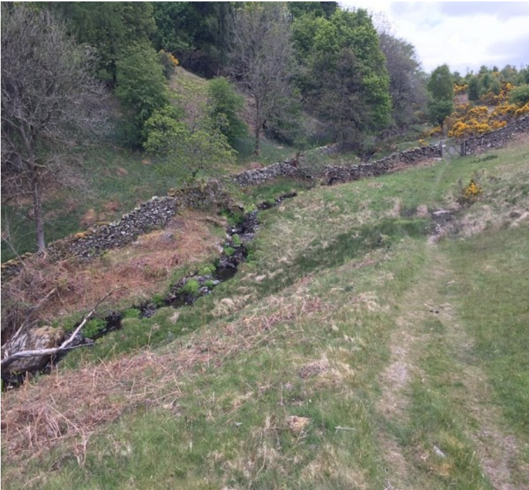
The source of the Gilpin.

Crossing the road to Crook Hall, you now pass through the back of High Lees and onto Low Fold. A turn left and then right at the crossroads takes you through pasture and then on to the open access land of Lords Lot. The paths up to the viewpoint at the top are indistinct so you need to roam off piste to find the cairn at the top, returning the same way to the footpath after your diversion.