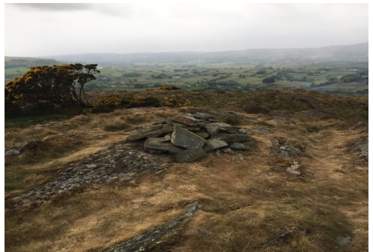
The prominent cairn on Crook Head (left) and a less imposing one on Lords Lot looking down on a drizzly day (Right)