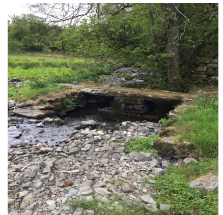
Bridges across the Gilpin.