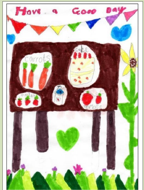
Lorna Dobson (age 7)