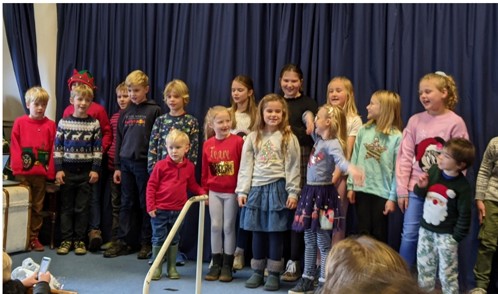
Crosthwaite Christmas Fair - Saturday, 4th December 2021

Cover picture: Supernumerary rainbows over the vicarage (Charles Walmsley) Church miniature pictures from watercolours by John Wilcock